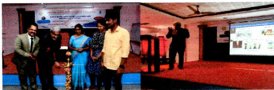
Dignitaries Lighting the Lamp