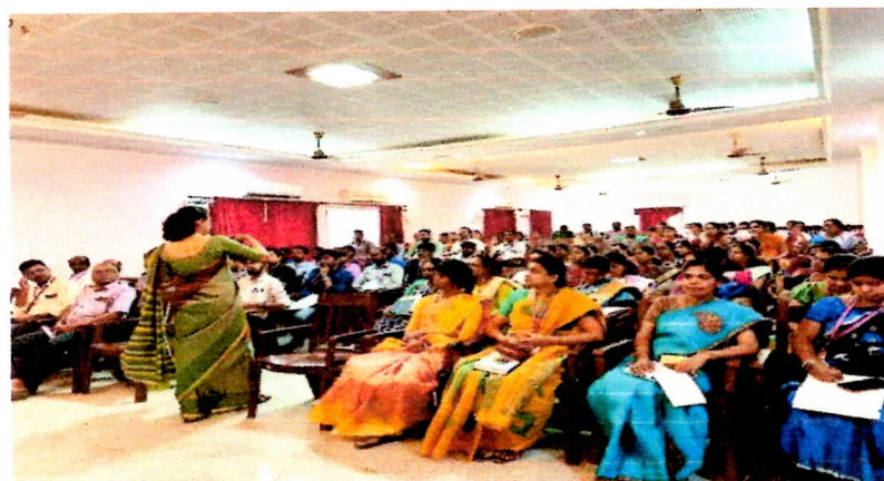
Deliberation by the Resource Person