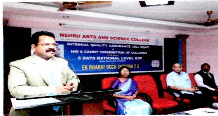
Presidential Address by our Principal