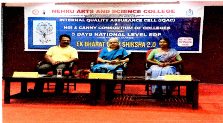
Valedictory Session of Five Days EDP