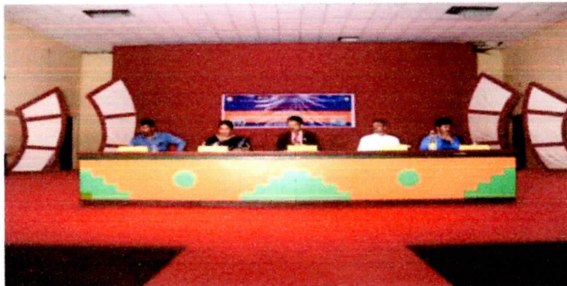
Valedictory Session of Research Exchange Programme