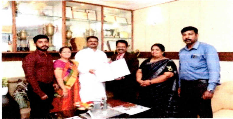
Exchange of MoU with H. B. Desai College, Pune