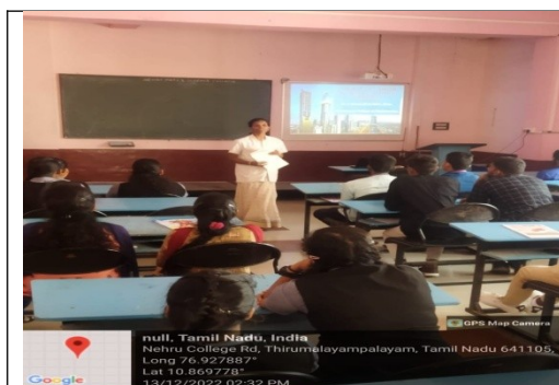
HoD Welcome the Chief Guest