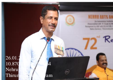
26.01.2021 09:55 10.870107, 76.928364 Nehru Arts and Science College Thirumalayampalayam