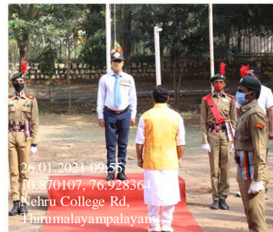
26.01.2021 09:55 10.870107, 76.928364 Nehru Arts and Science College Thirumalayampalayam