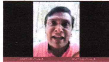
Virtual Onam | NEHRU ARTS AND SCIENCE COLLEGE | ONAM CELEBRATION 2020