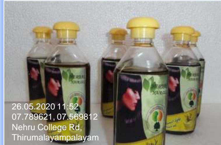
HERBAL HAIR OIL