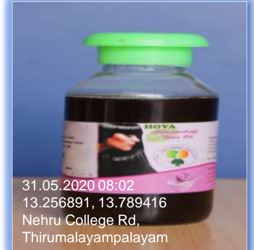
HERBAL ANTI-DANDRUFF OIL