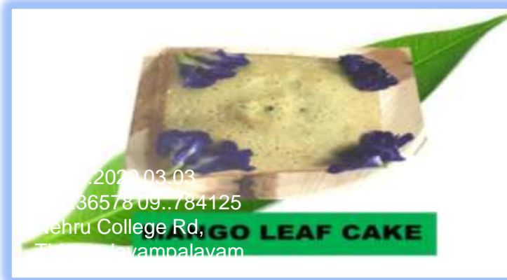
MANGO LEAF CAKE