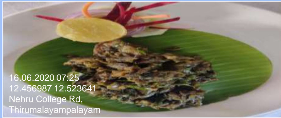
DRY PEPPER CHICKEN