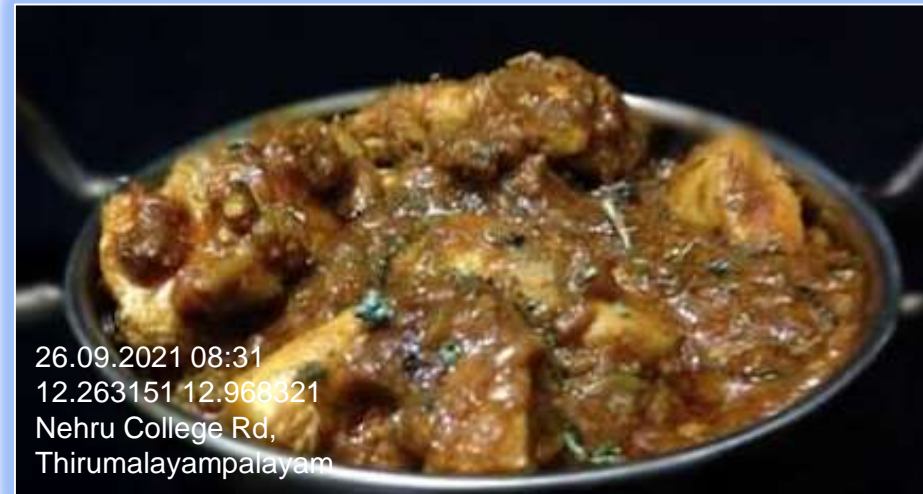
PALLIPALAYAM CHICKEN MASALA