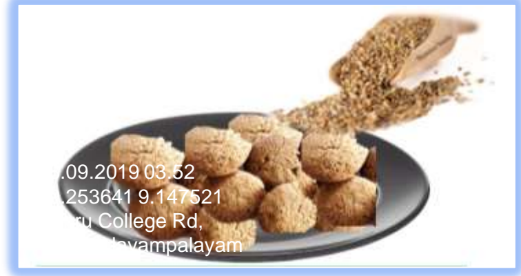
PEARL MILLET COOKIES