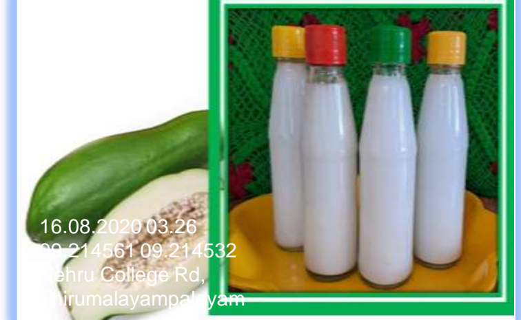
GREEN PAPAYA DRINK