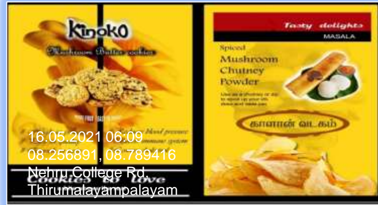
MUSHROOM POWDER, CHUTNEY POWDER AND MUSHROOM PAPPAD