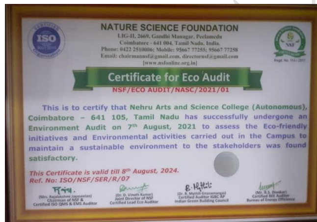
Certificate of Merit for “Environment (Eco Audit)” from Nature Science Foundation 2020