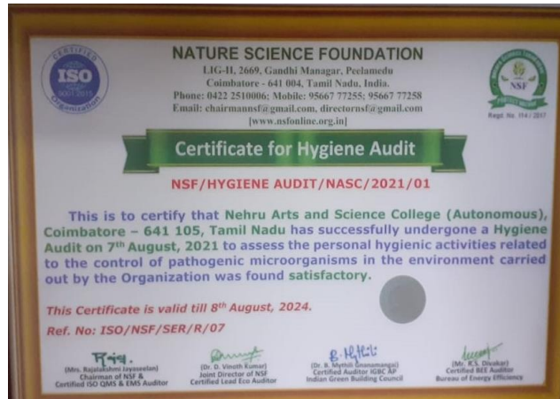
Certificate of Merit for “Hygiene Audit from Nature Science Foundation 2020